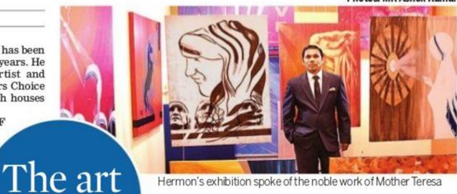
Hermon's exhibition spoke of the noble work of Mother Teresa

"Prayers have given me the positive energy to create more than 400 pieces of artwork," said Hermon, who is also